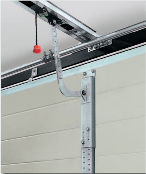
Installation bracket for sectional doors (special fitting)