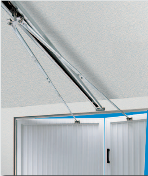
Special fitting for swing gate doors (Attention: If the automatic door lock is desired, please order our special rails for swing gate doors)