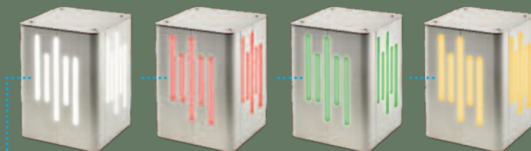
Warning light fitting made of RVS100 with LED light. Dimensions (WxHxD): 100x132x100 mm